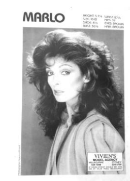
Siren of the 60's