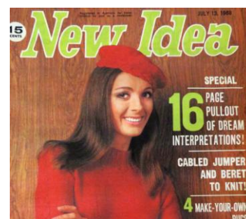
Who cares about the knitting pattern when it's on someone like this.