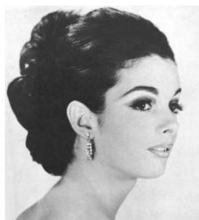
A mix of Liz Taylor with a little Princess Margaret thrown in.